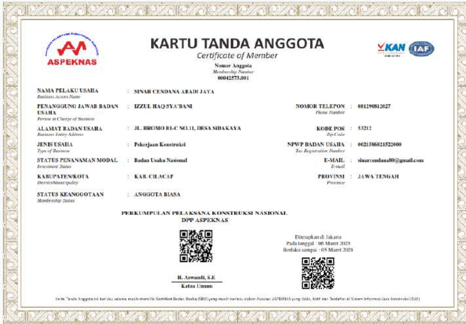
Member Card of National Contractors Association