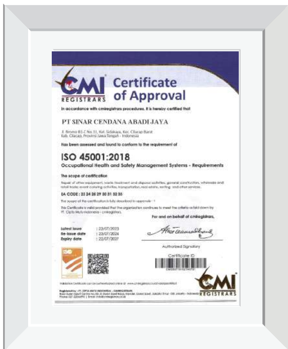
MSECB Certificate ISO 45001:2018