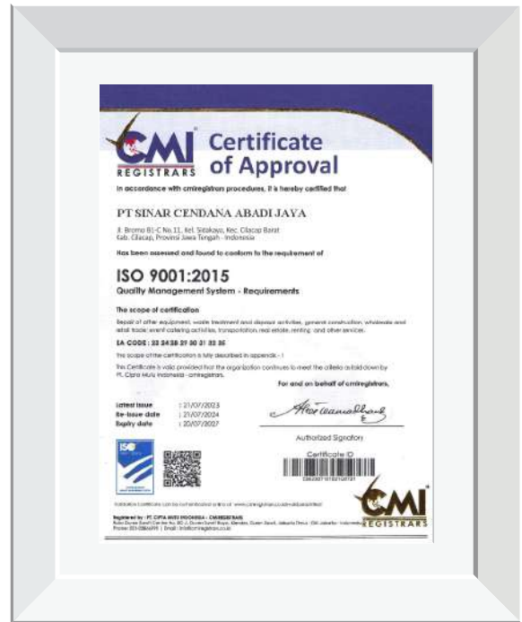
MSECB Certificate ISO 9001:2015