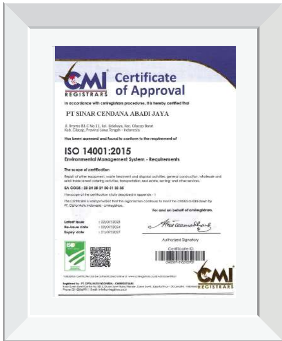
MSECB Certificate ISO 14001:2015